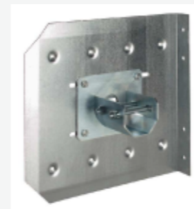
Side-flange with support cod. 75330000