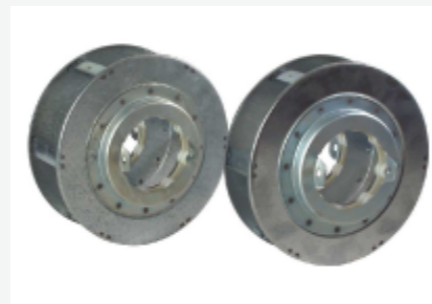
Spring box 101,6 x 280mm For springs width 60/80 mm cod. 75310000