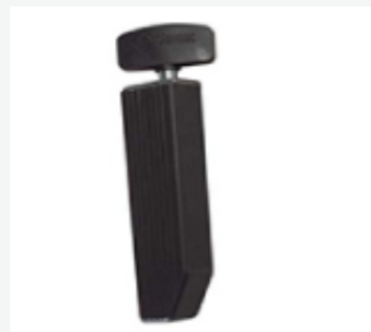
Brake release handle cod. 75160000