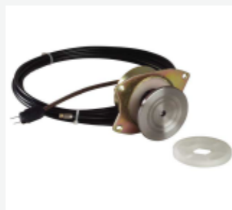
Electromagnetic brake cod. 75150000