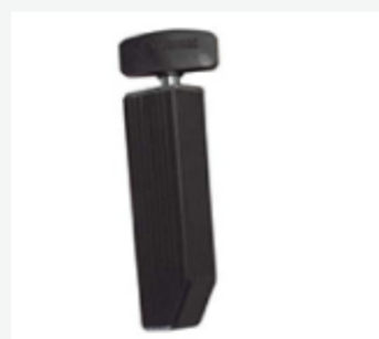
Brake release handle cod. 75160000