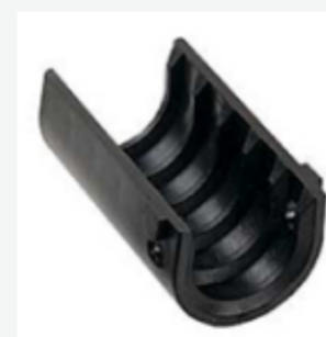
Tube adaptor from Ø 60 mm to Ø 48mm cod. 75260000