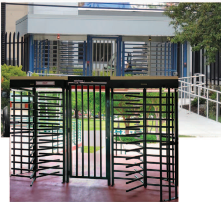
Shown with matching HS336 Full Height Gate