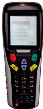
Wireless Portable Programmer