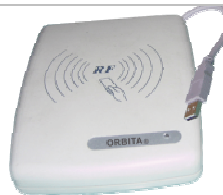
Proximity Lock Encoder