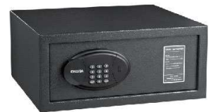
Hotel Room Safe