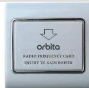
Energy Saver Unit